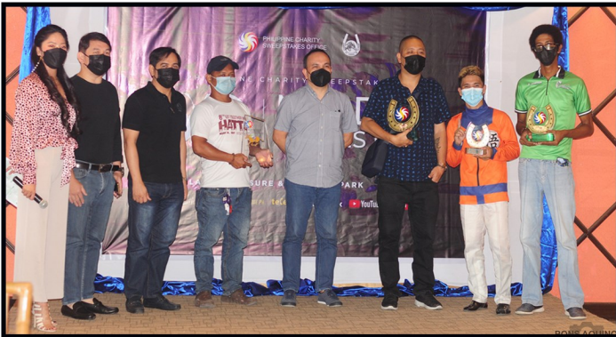
The winning connections of winning horse Mommy Caring with MJCI & PCSO representative during the awarding ceremony at MJCI, Carmona, Cavite

She Is Rich Enough, Sir Prancealot and Tokyo Tokyo Rumba grabbed their share of the P1-million purse as runners-up (P225-thousand, P125-thousand and P50-thousand, respectively).