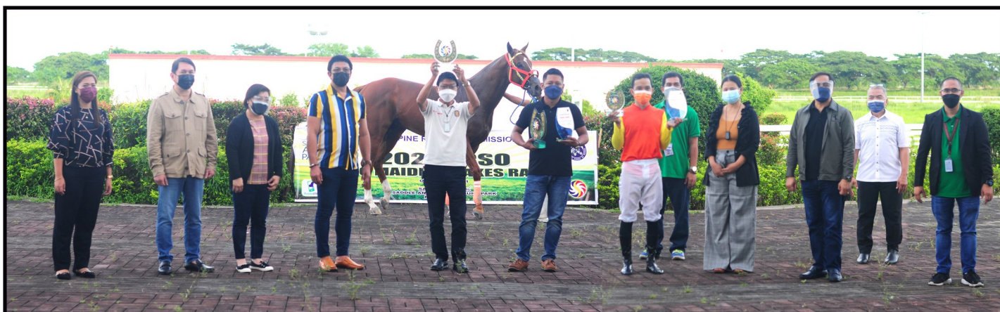
PCSO, Philracom and PRCI officers during the awarding ceremony of PCSO 2 Year Old MAIDEN at PRCI Sta Ana, Naic Cavite

Coming in second was Enigma Uno for P200-thousand followed by Tinago Falls (P100-thousand) and Hot Rot Hearts(P50,000).